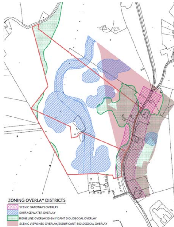
Figure B – Overlay Districts

Surface Water, Scenic Gateways and Ridgeline Overlay Districts, see Figure B. Compliance with these districts will be addressed with the Village Town Board and Planning Board during the SEQR and Site Plan Approvals.