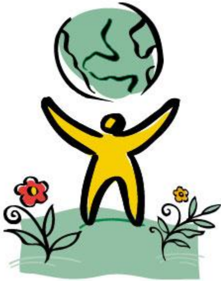
Figure 4: Based on established research and theory in child development and education, The World at Their Fingertips continuously evolves, reflecting new research and best practices in the field of early education, along with our close relationship to NAEYC.

Beginning with their initial enrollment, we assign each family to a primary caregiver to ensure that children and families receive individualized attention. Primary caregivers play special roles and are responsible for children’s prime times: those critical one-to-one moments of caring, play, education, nurturing, and communication.