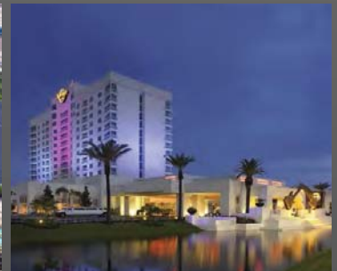
Seminole Hard Rock Tampa