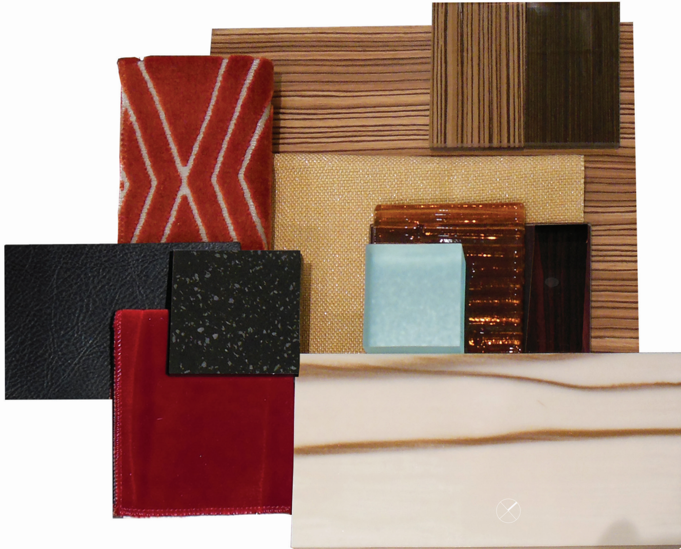
ATTACHMENT 'E' Exhibit VIII.C.5.c