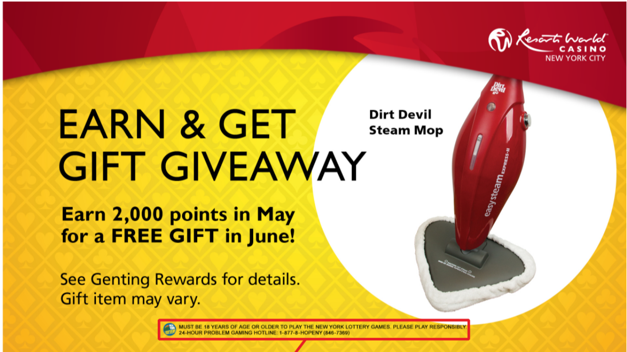
Figure X. A.2-6. Example Responsible Gaming Tagline for Printed Marketing Collateral

The following is an example of a type of responsible gaming tagline that will be printed on all marketing collateral: