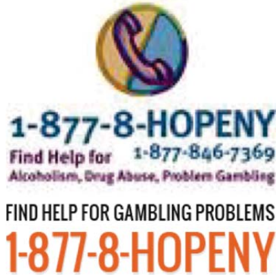
Figure X. A.2-4. Sterling Forest Resort Responsible Gambling Landing Page