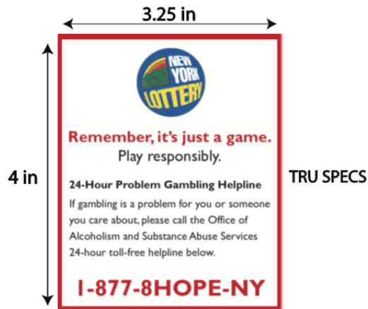
Figure X. A.2-2a. Wide Area Messaging Signage

Sterling Forest Resort will work closely with the New York Council for Problem Gambling to market their messages: 'KNOW THE ODDS' and 'PLAY RESPONSIBLY'. These messages will be found in a clear and visible manner throughout the casino in different languages and a variety of forms including brochures, posters, TRUs, ATMs, and electronic media (in-house TV, player information displays [PIDs], etc.).