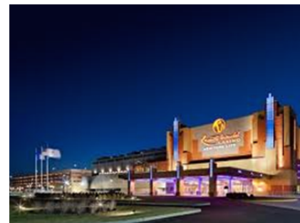
Table VIII. A.15.a-1. Resorts World Casino New York City

The most recent development is Resorts World New York City (RWNY). The facility was constructed in one year, opening in October of 2011 and since that time has consistently been the highest grossing slot operation in the United States. Operating under the jurisdiction of the New York Lottery and subsequently the New York Gaming Commission, RWNY has grossed nearly $2 billion since inception, generating over $800 million for education in the State of New York.