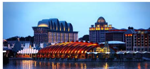
Table VIII. A.15.a-3. Resorts World Sentosa

Resorts World Sentosa, was opened in January of 2010 which is an integrated resort on the island of Sentosa located off the southern coast of Singapore. The key attractions include one of Singapore's two casinos, a Universal Studios theme park, Adventure Cove Water Park, and a Marine Life Park. The Marine Life Park is the world's largest oceanarium consisting of 100,000 animals and 45,000,000 gallons of water. The $4.93 billion resort is one of the world's most expensive casino properties occupying 121 acres of land and employing more than 10,000 people directly.