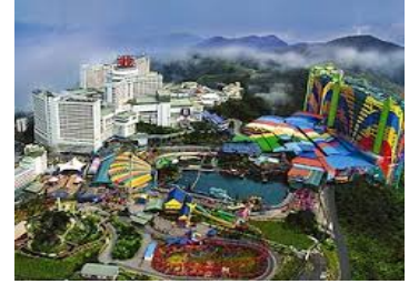
Table VIII. A.15.a-7. Resorts World Genting

Originally opened in 1971, Resorts World Genting (“RWG”) has become a premiere “Integrated Resort” in Southeast Asia. The resort features over 9,000 hotel rooms, over 80 dining options, over 500,000 square feet of retail, indoor and outdoor theme parks, 150,000 square feet of MICE space as well as a championship golf course. In 2013, the facility hosted nearly 20 million visitors. RWG employs approximately 14,000 individuals, some for the past 40+ years. In 2013, RWG began construction of the world’s first Fox theme park and the new attraction is expected to open in 2016.