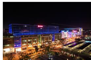
Table VIII. A.15.a-5. Resorts World Manila

The Genting group developed the first casino resort in the Philippines. Resorts World Manila was opened in August of 2009. The project, occupying part of a former military camp near Manila's airport, has three hotels with 1,574 rooms, a 323,000 square foot casino and a 300,000 square foot shopping mall.