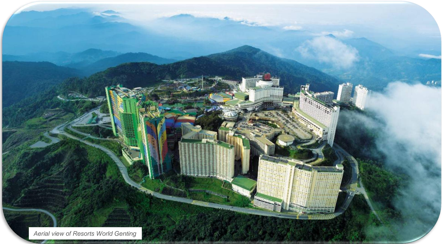
Aerial view of Resorts World Genting