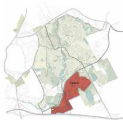
Casino Resort Program