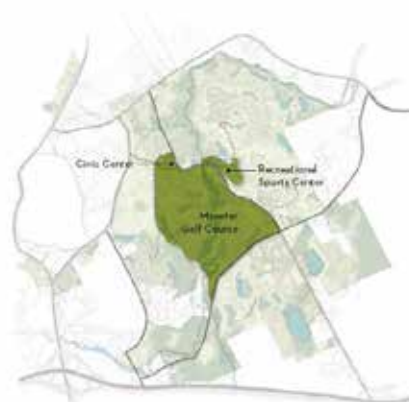
Golf, Recreation, and Civic Program

Finally, Adelaar’s Commercial Design Guidelines, attached as Attachment VIII.C.5.b.-1, provide additional background on and descriptions of the basis for the overall architectural and building plan of Adelaar, as well as its defining themes and styles, and also the interrelation of and principal decisions regarding the layout of the building program; the consolidation or segregation of major functions, activities and uses; and the configuration of the building program to meet any constraints or opportunities presented by Adelaar.