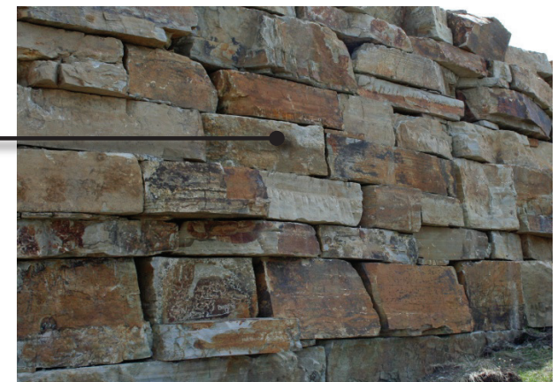
STONE RETAINING WALLS