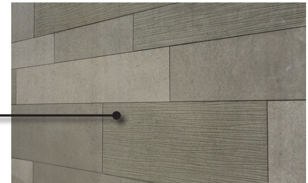
VARIED TEXTURED PRECAST PANELS