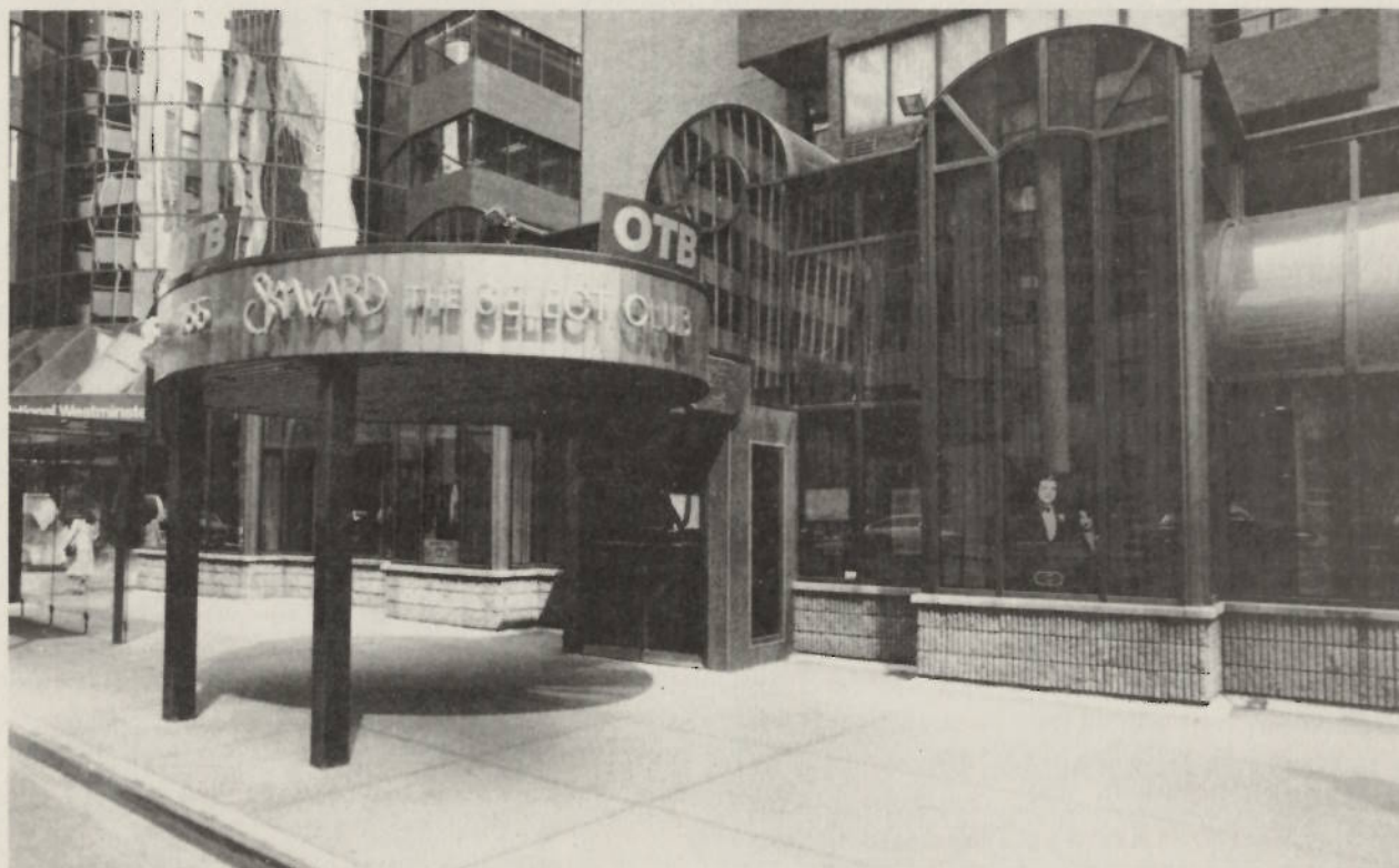
New York City OTB's "Select Club", the State's newest Simulcast Theater, located in the heart of the City's financial district.

NYCOTB opened its second simulcast theater on March 24, 1987. This new theater, called "Skyward — The Select Club" is at 165 Water Street in lower Manhattan. It accommodates 350 patrons. Full restaurant service, including alcoholic beverages, is available in a modern attractive setting. Track prices are paid on in-state simulcast races. Total handle at this new facility in 1987 was $17.1 million, with a daily average thoroughbred handle of $39,608 and a daily average harness handle of $11,306. Daily per capita wagering for thoroughbred races was $333 and $96 for harness races. Total daily per capita wagering was $429 for the Select Club.