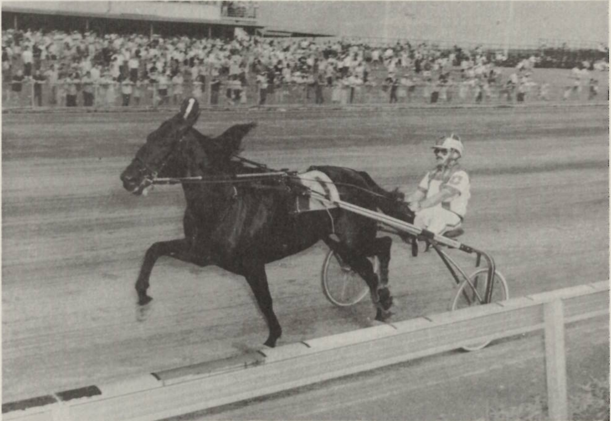
World Champion Trotter MACK LOBELL tied Vernon Downs' 1:56 All-Age Trotting Record in the 1987 Founders Gold Cup Stake for Three-Year-Olds. Race was captured by BUCKFINDER.

extended meetings were down in average handle from (5.17%) at Monticello Raceway to (18.79%) at Buffalo Raceway, and down in daily average attendance from (1.94%) at Saratoga to (16.33%) at Roosevelt Raceway.